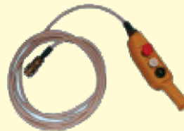
Remote Controller (Standard Length 10mtrs, Can Be Supplied In Users Required Length)