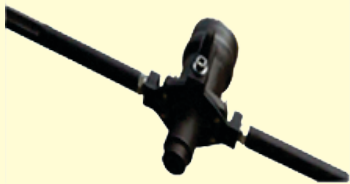
Tube Expansion drive head

Powerflex tube expansion system is supplied with following standard accessories